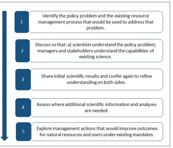
Figure 2: Outline of the steps for incorporating information for ecosystem models into management, adapted from Townsend et al. 2020.

NOAA Fisheries' teams identified in Goal 1.c can assess and articulate regional decision-makers' ecosystem and climate science needs (including ecological, social, and economic components), and develop science plans to address those needs in coordination with other efforts such as IEA, CEFI, and protected resources and habitat programs. For each science need identified, managers and scientists should ensure the decisionmaking process provides a clear onramp for using the scientific information. NOAA Fisheries will work internally and with external management partners to co-develop